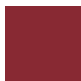
dark red 3603

stainless steel: available in various structures and surfaces on enquiry