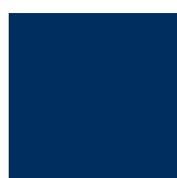
dark blue 5603